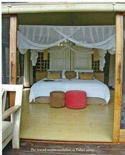
The tented accommodation at Pafuri camp.